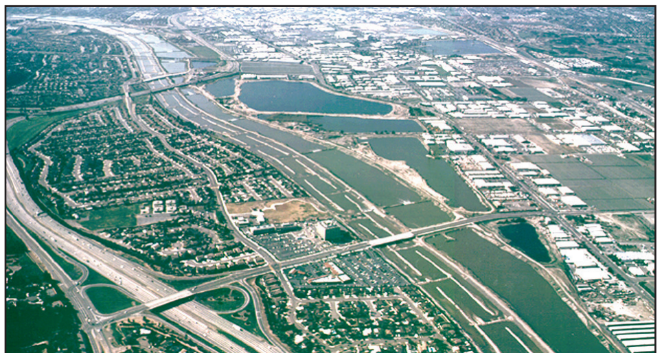
Orange County Water District facilities along the channel of the Santa Ana River )

The geology of the groundwater basin consists of alternating layers of uncemented fine- and coarse-grained sediments in a synclinal trough that plunges toward the northwest. Wellbores typically penetrate 10 to 15 different water-bearing layers over a depth of up to 1,500 ft [460 m]. By the mid-1980s, OCWD had determined that information on the piezometric level and water